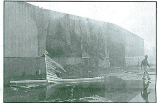
Zen-Noh Hay June 20, 1996

Kennewick, WA - Hermiston, OR General Contractor Since 1974